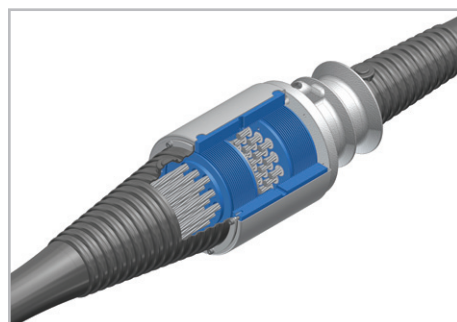
Coupler H (fixed)