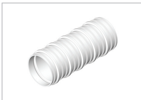
Plastic Duct (round)